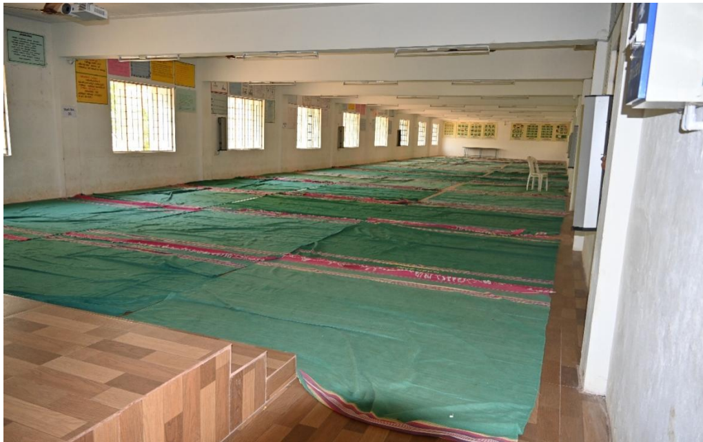
Students Counselling Centre: